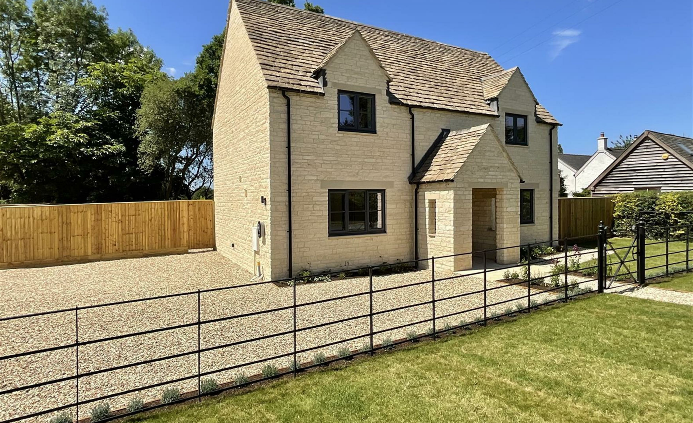
The Divot, Upper Minety, Wiltshire, SN16 9PY Prices From £675,000